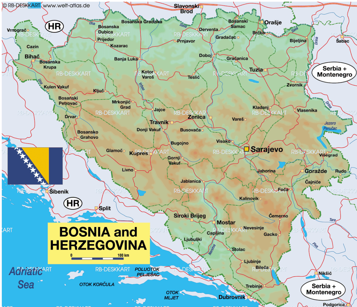
Map 1. Bosnia and Herzegovina

“Map of Bosnia and Herzegovina” [map]. Visual Scale. Atlas of The World: Bosnia and Herzegovina .