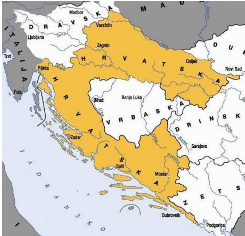
Map 2. The map of “Banovina of Croatia”

Draganović, K. Stj. “Banovina Hrvatska, 1939. - 1941.” [map 18]. In: Sančević, Zdravko. Pogled u Bosnu . Zagreb: Naprijed, 1998. (pp. 82)