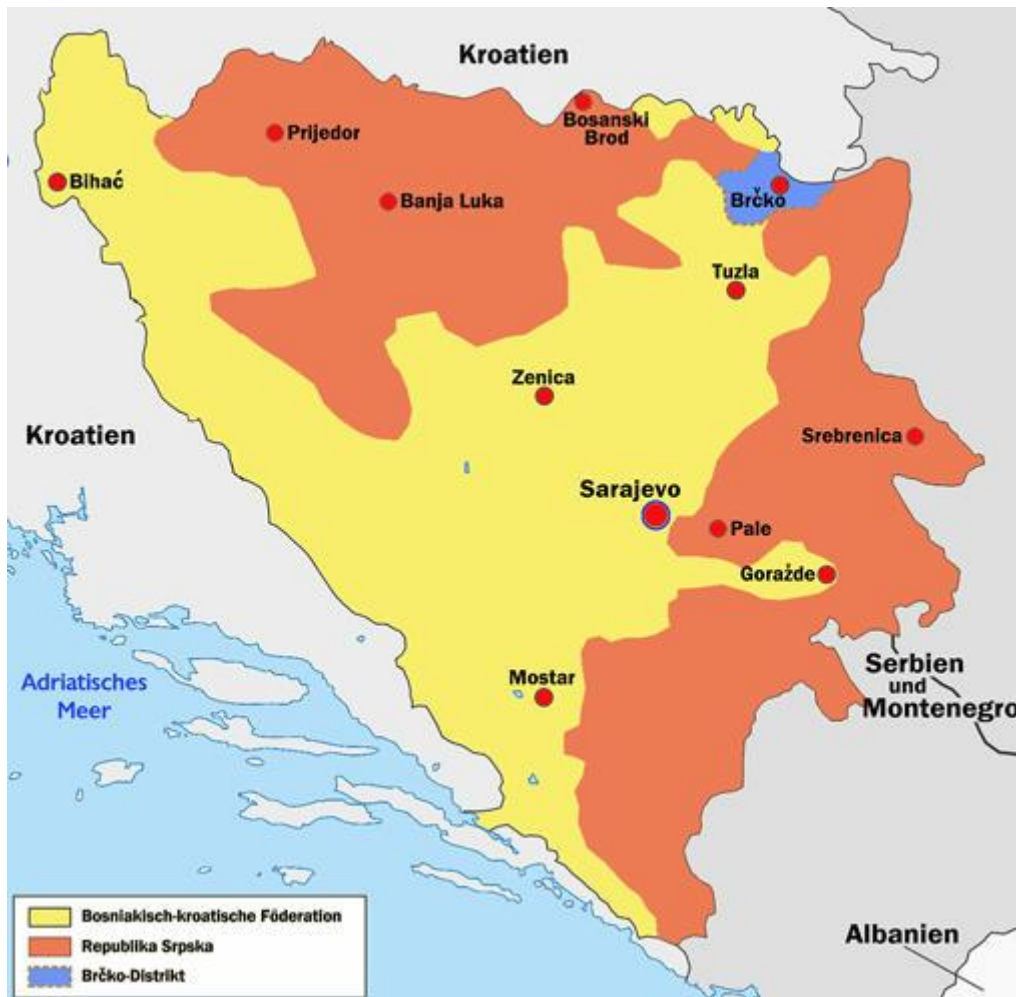
Map 4. Map of the post-Dayton Bosnia

“Dejtonska karta Bosne i Hercegovine” [map]. Visual Scale. Deutsche Welle : Bosnia and Herzegovina .